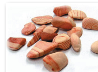
珪藻土 Diatomaceous earth

Diatomaceous earth is the deposit of the fossilized shells of diatoms, which are one-celled plants in waters. Its surface has micro-pores 5000 to 6000 times more than char coal. Beside non-combustible, sound insulating, waterproofing and thermal insulating, it also has the properties of moisture adsorption, odor removal and air purification.